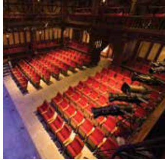
FIXED AND PORTABLE AUDIENCE SEATING